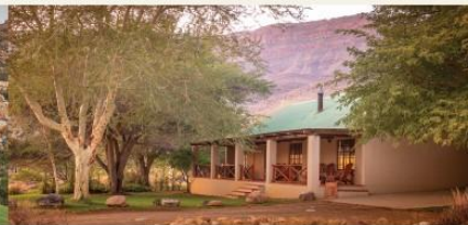
KAREEBOOM | 8 Sleeper with wood fired hot tub Kareeboom is located at the foot of the mountains and has a lush green lawn and a hot tub in front of the large stoep leading into the house.