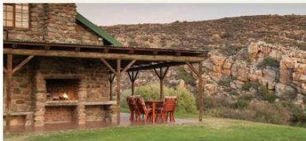
WABOOMHOEK | 6 Sleeper Waboomhoek has a unique location close to large pools in the perennial Groot river. There is a private spot at the river that is accessible down a path from the front lawn.

Our three campsites accommodate up to 6 guest each and are spaciouly spread out at the foot of the towering Blinkberg Mountain. Each site has its own private ablution and scullery as well as a braai/barbeque area.