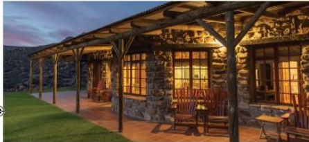
BLINKBERG | 6 Sleeper with wood fired hot tub Nestled on the slopes of Tuinskloof ridge, Blinkberg house has a wonderful view of the Klipbokkop mountain range, which can be seen from the large terrace in front.

These three houses are situated next to each other and are within easy walking distance from the restaurant. The view of Blinkberg's stunning red rock face is prominent from the outside entertainment areas.