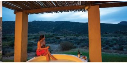
PUNTJIE | 6 Sleeper with jacuzzi Puntjie is situated at the end of the Tuinskloof ridge. This house has a protected outside braai/barbeque nook on the terrace, creating a comfortable outdoor entertainment area to enjoy at any time of the year.