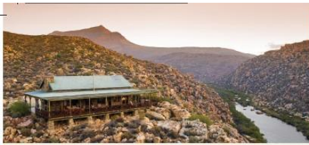
KLIPBOKKOP | 6 Sleeper with jacuzzi Our most exclusive house boasts a magnificent 360-degree view of the surrounding landscape. Situated on top of a rocky ridge, our guests enjoy the spectacular view as the Groot River meanders its way down through the valley below.

Includes fully equipped kitchen, linen, towels, and braai facilities