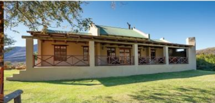
TAAIBOS | 6 Sleeper Taaibos is located next to the Groot river and the view from the terrace is completely private. The sunset view of the river in the evening is enchanting.